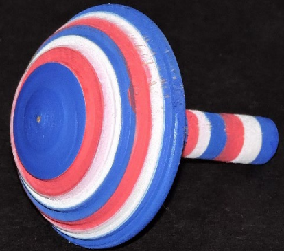
Sherry Loughen Top Maple