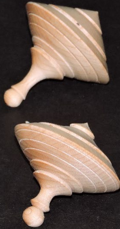
Brian Rosencrantz Serial Box Tops Maple