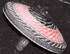
Randy Cooley Top Maple