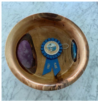
First place bowl!

Project Lift classes starting soon! Please contact me if you're interested in mentoring young people interested in learning the art of Woodturning. Project Lift mentors will need to fill out liability forms, go through a background check and must be current AAW members. Classes are slated to occur Monday / Tuesday for about 4-5 hours, and we'll be trialing classes one week a month. Schedules may change in the future as needed.