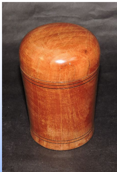
John Hart Box Mahogany