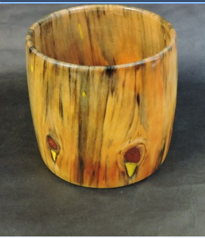
Ed Stavish Vessel Norfolk Island Pine