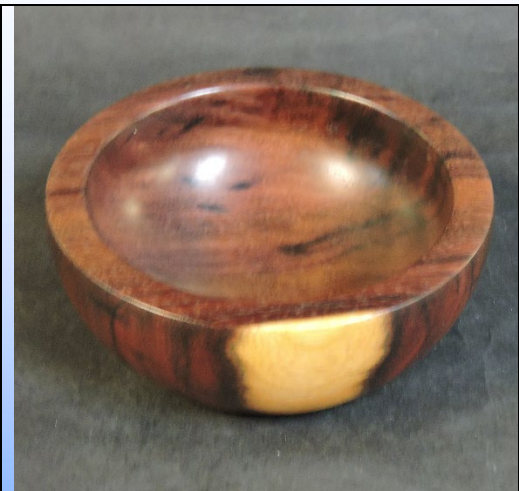
Ken Kirkbride Bowl