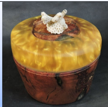
Barbara Best Lidded Box Coral, resin, wood