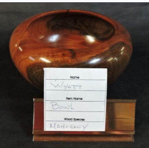
Wyatt Bowl Maphogany