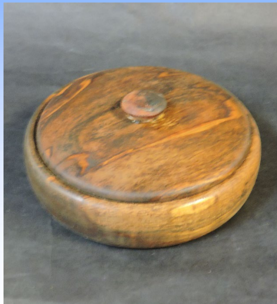
Amber Strand Beech