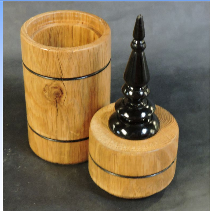
Abe Loughin Lidded Box Oak / African Ebony