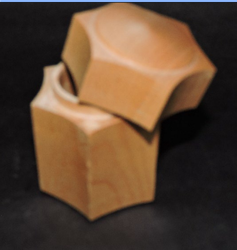
Brian Rosencrantz Thermed Box Maple