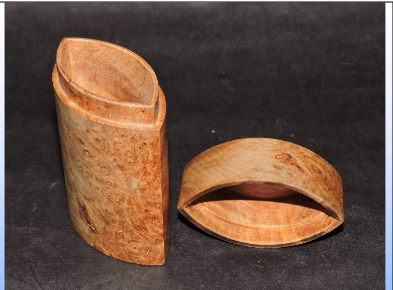
Brian Rosencrantz Lost wood Box Maple Burl