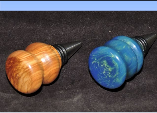
Abe Loughin Bottle Stopper Acrylic