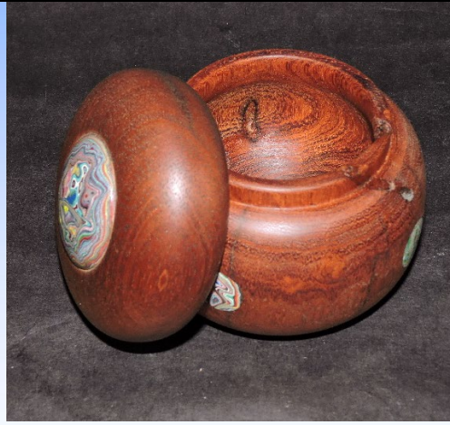
Jimmie Porter Lidded Box Mesquite