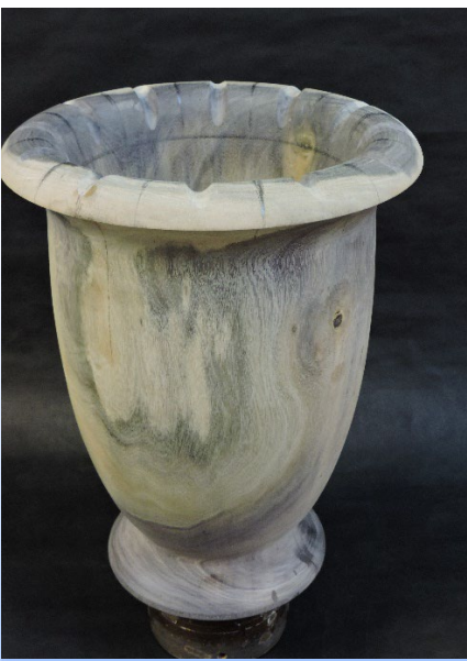
Paul C Struve WIP Vessel Blue Mahoe