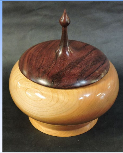
Ken Kirkbride Lidded Box Base – Cherry / Top Mahogany