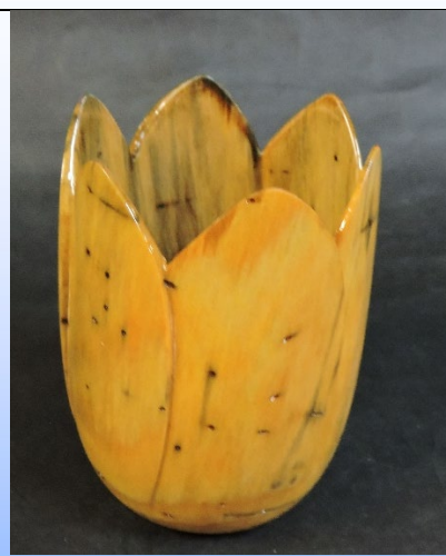
Wyatt Vase Pine