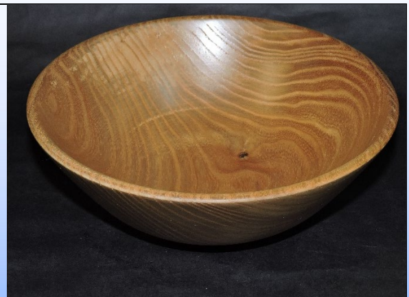
Al Parmentiev Bowl Catalpa