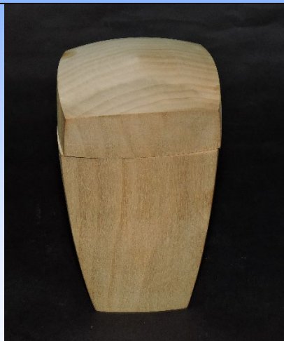
Brian Rosencrantz Thermed Box Poplar