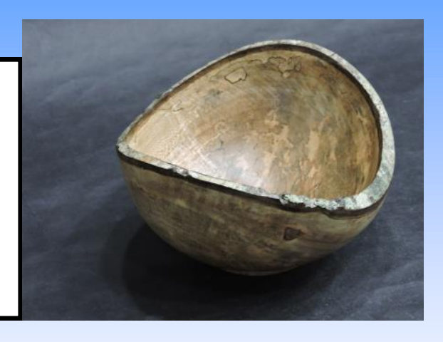
HAROLD REHEIS NATURAL EDGE BOWL LIVE OAK